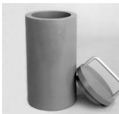
Auxiliary Shield: Item #5420-2116