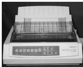
Okidata 120V Printer: Item #5130-0074 Okidata 220V Printer: Item #5130-1150