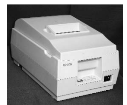
Epson Roll Printer: Item #5430-0058

9282-0009 Paper Rolls, 3" x 128', White, 10/pkg. 9282-0010 Paper Rolls, case of 50