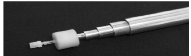
Close up end of NEMA PET Sensitivity Phantom™

5 internally stacked aluminum tubes all 700 mm in length 1 st Tube inside diameter 3.9 mm, outside diameter 6.4 mm 2 nd Tube inside diameter 7.0 mm, outside diameter 9.5 mm 3 rd Tube inside diameter 10.2 mm, outside diameter 12.7 mm 4 th Tube inside diameter 13.4 mm, outside diameter 15.9 mm 5 th Tube inside diameter 16.6 mm, outside diameter 19.1 mm The innermost tube, a fillable polyethylene tubing has an inside diameter of 1 mm, outside diameter 3 mm