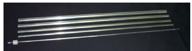
Set of aluminum tubes used in NEMA PET Sensitivity Phantom™